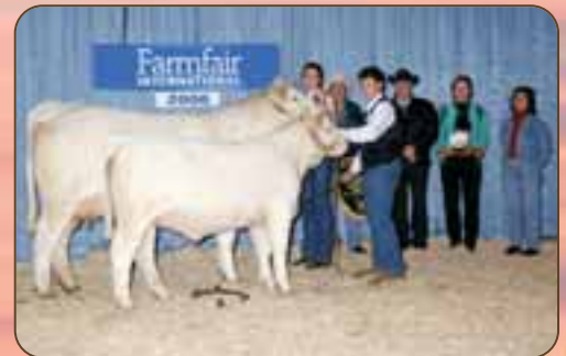
610S and her dam 406P

Her dam is Lot 5, maternal sisters are Lots 53 and 55 and two maternal brothers are Lots 48 and 56. Sells open and ready to flush.