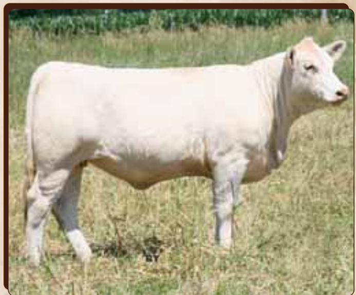
Lot 25 - ACC Kittykat 738T

Here is a nicely made, well balanced bred heifer, whose dam has a top bull calf this year.